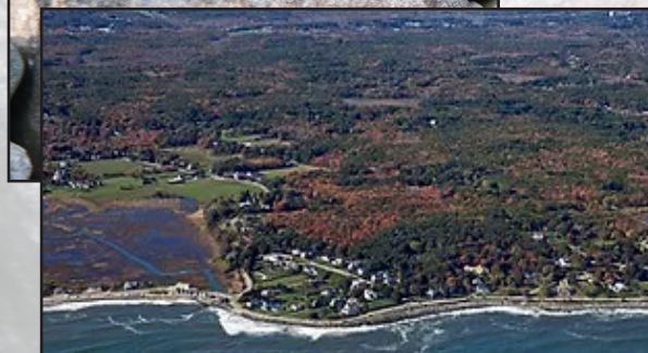
(Top) Locke Cemetery (Bottom) Locke's Neck, Rye, NY